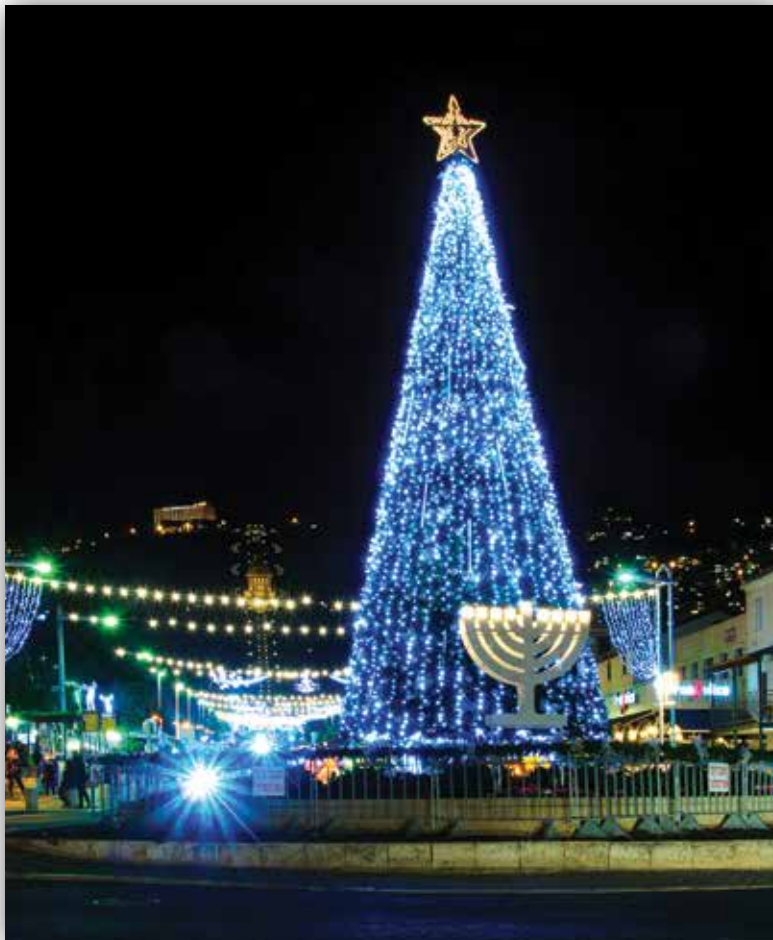
Christmas and Hanukkah in Haifa, Israel