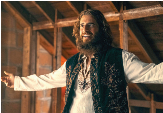
Jesus Revolution movie portrayal of hippie preacher