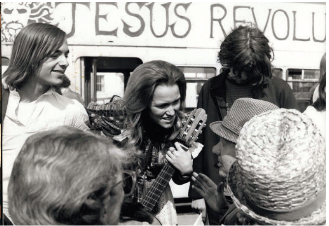
Hippies proclaiming Jesus