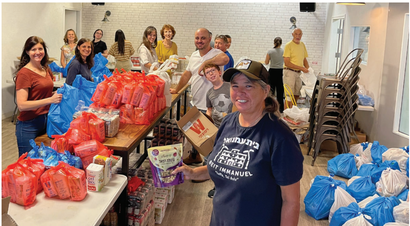
Making care packages for Israeli evacuees

I write this letter after conversations with social workers from different hotels, each housing