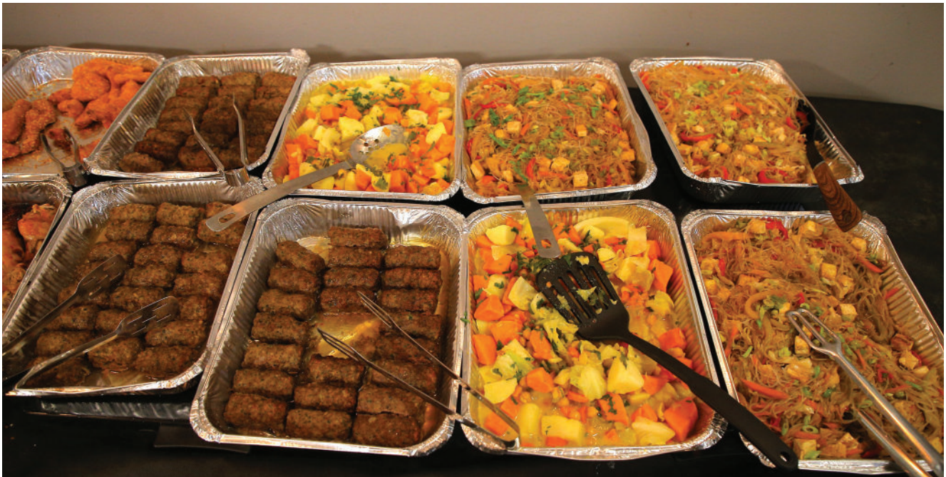
The most meaningful aid we provided was fresh, home-cooked food for soldiers.

The commander kept shaking my hand, and he said, "You have no idea how much this means to our soldiers. Yes, we have food, but it's tuna fish in a can." Home cooking means so much for the soldiers. Everyone was really grateful, and we took time to pray.