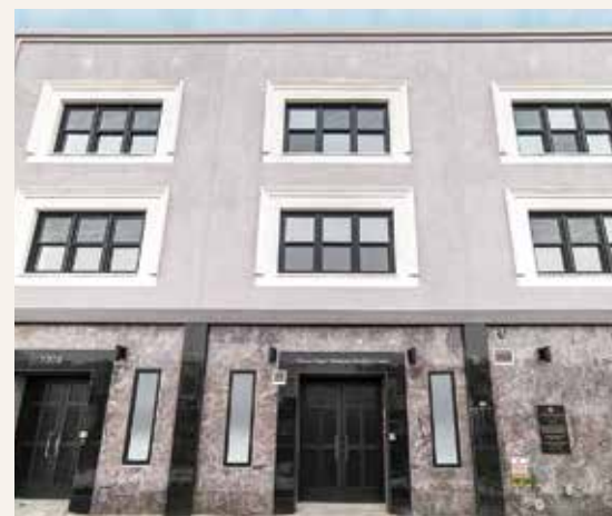
Messianic Center, Brooklyn, NY

We establish Messianic centers in various cities where we have branches. In addition to evangelism and discipleship, these centers, in facilities we own or rent, provide a setting for