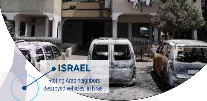
ISRAEL Rioting Arab neighbors destroyed vehicles in Israel.

Why do we do this? Why do we choose to endure such hardship and difficulties? Why do we ask our spouses