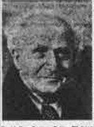
David Ben Gurion, Prime Minister

On Friday afternoon, from Tel Aviv, came the expected announcement of the Jewish State, and its official naming at both "Medinat Yisrael"—State of Israel, with the swearing in of the first Council of Government. The proclamation of the State was made at midnight, coinciding with the sailing from Haifa of Britain's last High Commissioner. Within the hour, President Truman announced in Washington that the Government of the United States had decided to give its full recognition to the Jewish State, with all that such recognition implied. The Assembly of the United Nations, meeting since the middle of April for "further study" of the Palestine problem, was thus left, by one means or another, to ratify the Two-State decision of November last year, or dissolve with nothing concrete to its credit. The Assembly adjourned with the resolution to appoint a mediator between the Jews and Arabs, to cooperate with the Security Council's Truce Commission in Jerusalem.