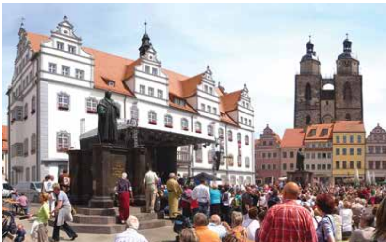
WITTENBERG MARKET SQUARE, WITH ANCIENT TOWN HALL, STATUE OF MARTIN LUTHER AND STADTKIRCHE

I recognize that we are all sinners and we need to love the person and hate the sin. I also realize that Luther did a lot of good