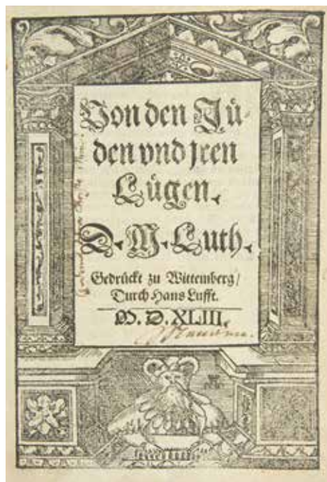
MARTIN LUTHER'S BOOK, "ON THE JEWS AND THEIR LIES" PUBLISHED IN 1543

Speaking for myself, Luther's anti-Jewish sentiments represent the deepest flaws of a deeply gifted man. In the end, we Christians can and should regret and condemn the errant words of this long-dead sinner, while at the same time recognize and lift up Luther's good words when and where they help proclaim Christ crucified and risen.