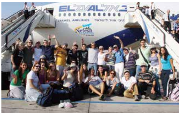
NEW IMMIGRANTS TO ISRAEL

As you continue to read the newsletter, you will see the details for our celebration of Israel’s 70th birthday that will take place in July 2018. This is going to be a fantastic Israel tour—on steroids! We are not only going to travel to the land, but we are also going to host a Bible conference, introduce you to our Israel