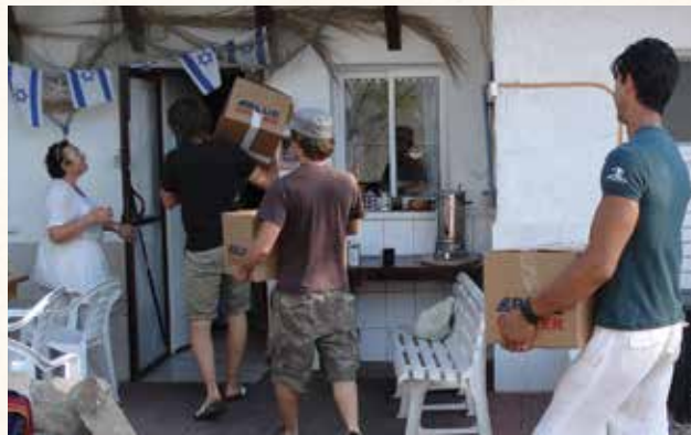
FOOD DISTRIBUTION IN SDEROT FROM THE JERUSALEM MESSIANIC CENTER