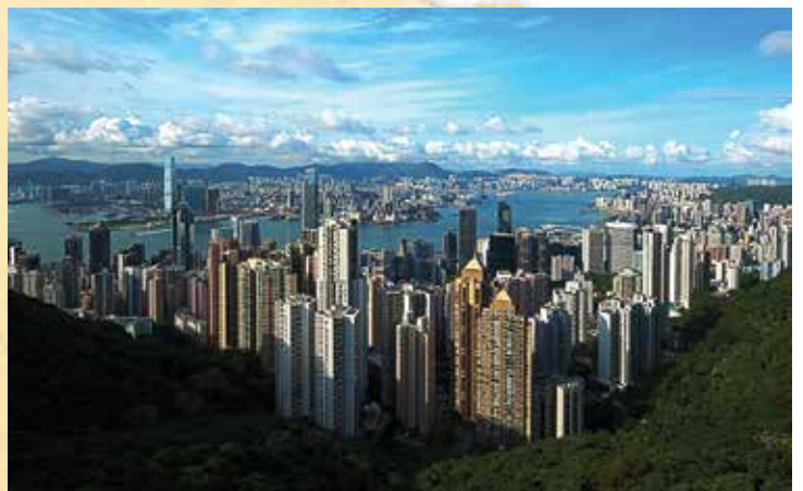
A view from Victoria Peak, looking north over Central, Victoria Harbour and Kowloon.

Please pray that I will continue to get opportunities to share my faith with God’s chosen people, and that He will give me wisdom, patience and love in my witness.