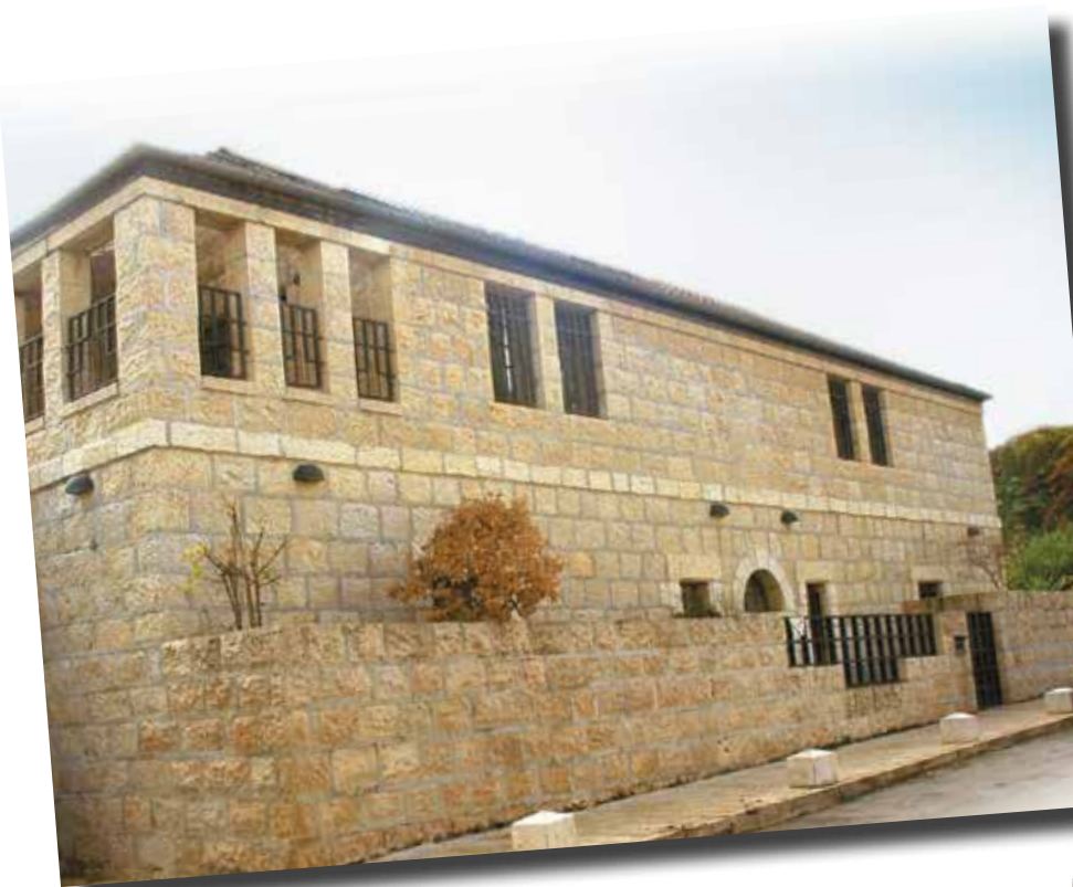
Jerusalem Messianic Center