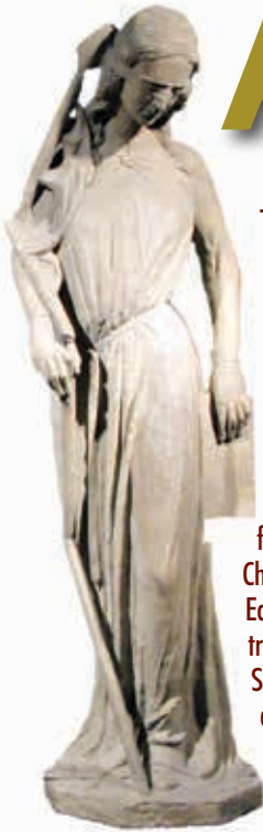
The well-known statues of Ecclesia and Synagoga, carved in about 1230 and situated at Strasbourg's Cathedral of Notre Dame, illustrate the Church's widespread teaching of contempt for the Jewish faith. Christianity, symbolized by Ecclesia, stands in triumphant contrast to Synagoga, who stands for a defeated and humiliated Judaism.