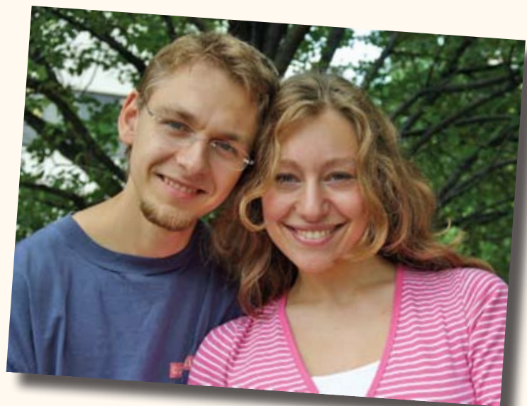
*names have been changed