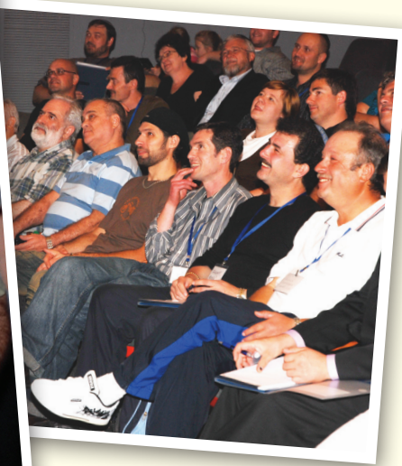
Second International Conference on Russian Jewish Evangelism