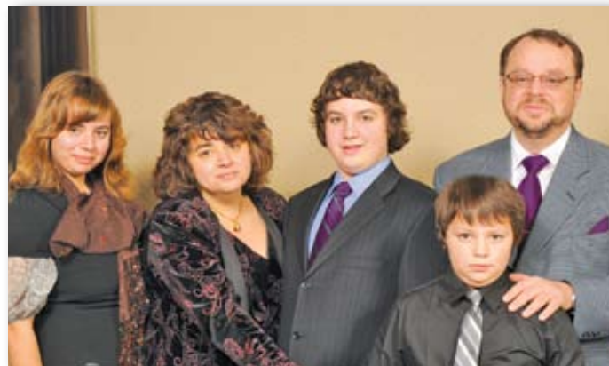
The Chosen People