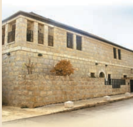
Our Jerusalem Messianic Center

With this in mind, we are kicking off our “To the Jew First” Advancement Campaign in light of entering our 116 th year of ministry. It