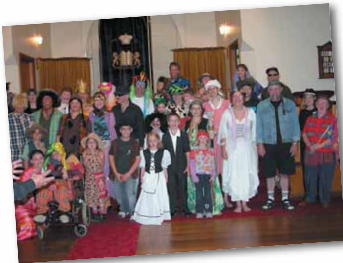
Purim celebrations include the reenactment of the story of Esther (Berlin, top) and dressing up in fun costumes (Israel, middle; Australia, bottom).

Purim! Is there a more festive celebration in the entire Jewish world? No indeed! Purim is a foot-stomping, shouting, eating, singing, joking Jewish carnival for all ages. The Book of Esther provides the background and Jewish tradition has taken it from there. Throughout the world, Purim is celebrated in many ways, as Jewish people from many cultures have infused their festivities with their own particular local customs.