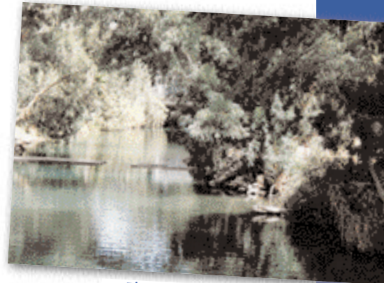
The Jordan River in Israel

At the start of the trip, about thirty Orthodox Jewish protesters tried to disrupt the group by offering the bus driver money not to take them and issuing threats.